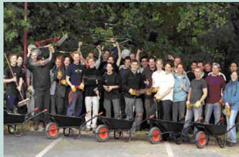
Pictured are graduates who took part in last year's Graduate Challenge.

The team will, amongst other challenges, be rubbing down and painting the fences that guide the entrance to the reserve, to make them look brighter and more presentable.