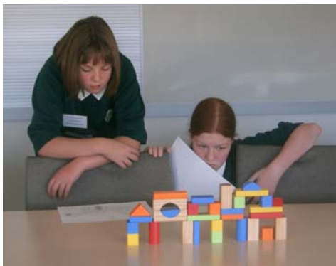
In the "Architects Office"

Promoting construction as a positive career choice