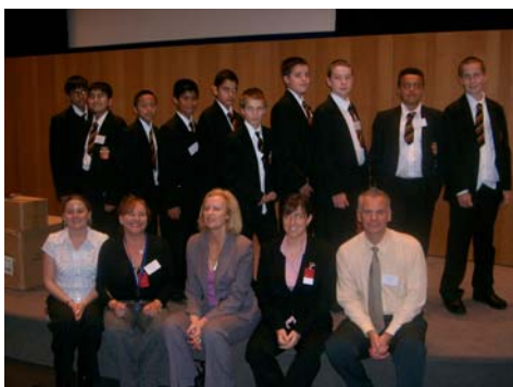
The Carillion team with Isleworth & Syon students