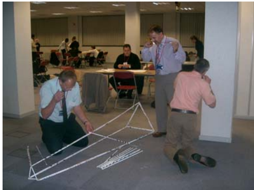
The teachers joined in with the challenge!!!

Learning and Development benefits for both the staff involved & the students